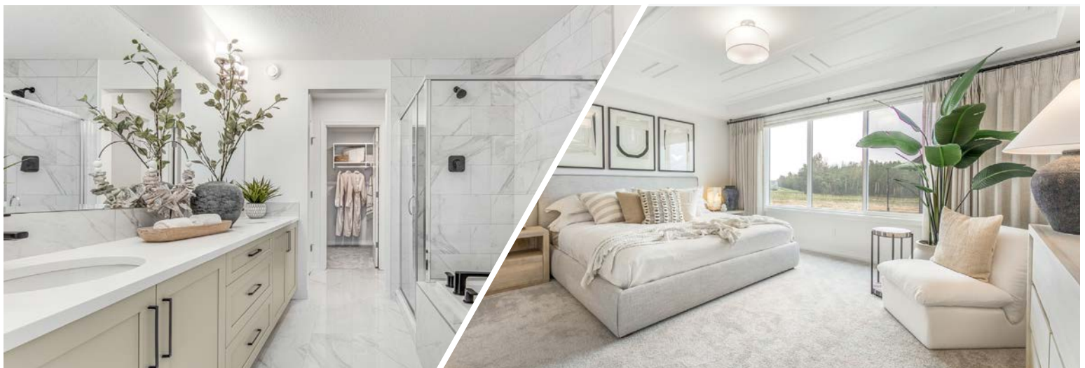
Renderings and images are representational only.