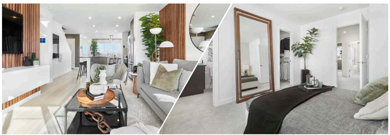
Renderings and images are representational only.