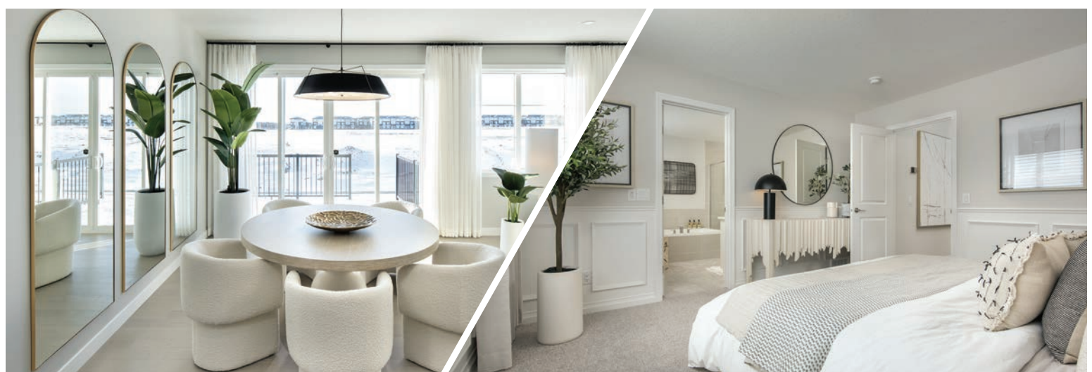
Renderings and images are representational only.