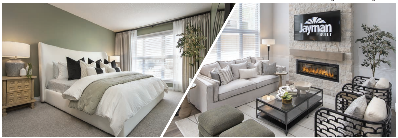
Renderings and images are representational only.