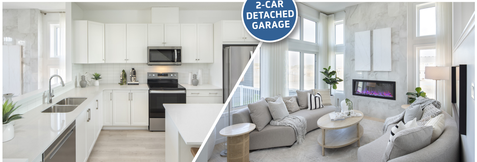
Renderings and images are representational only.