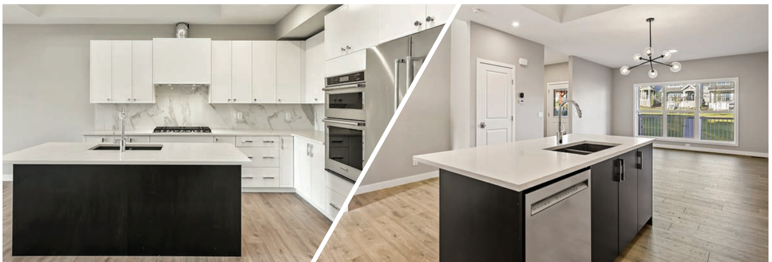
Renderings and images are representational only.