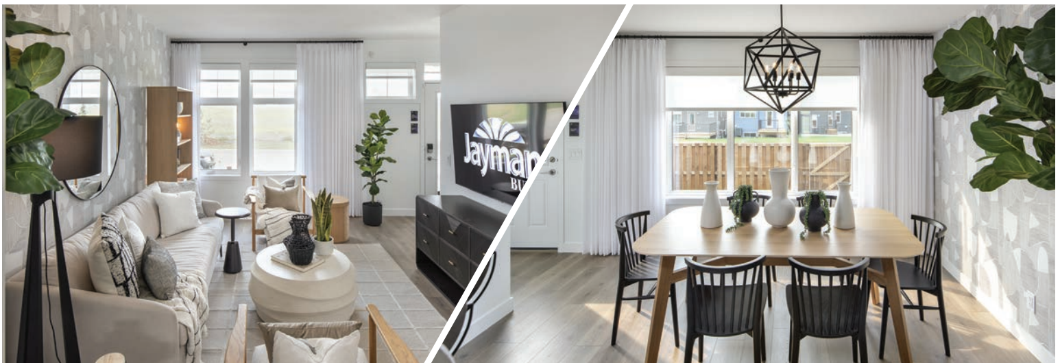
Renderings and images are representational only.