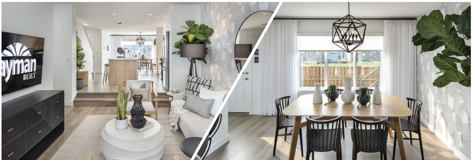
Renderings and images are representational only.