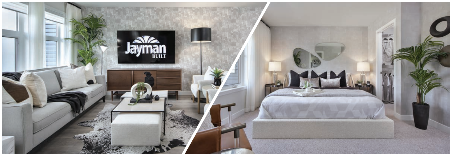
Renderings and images are representational only.