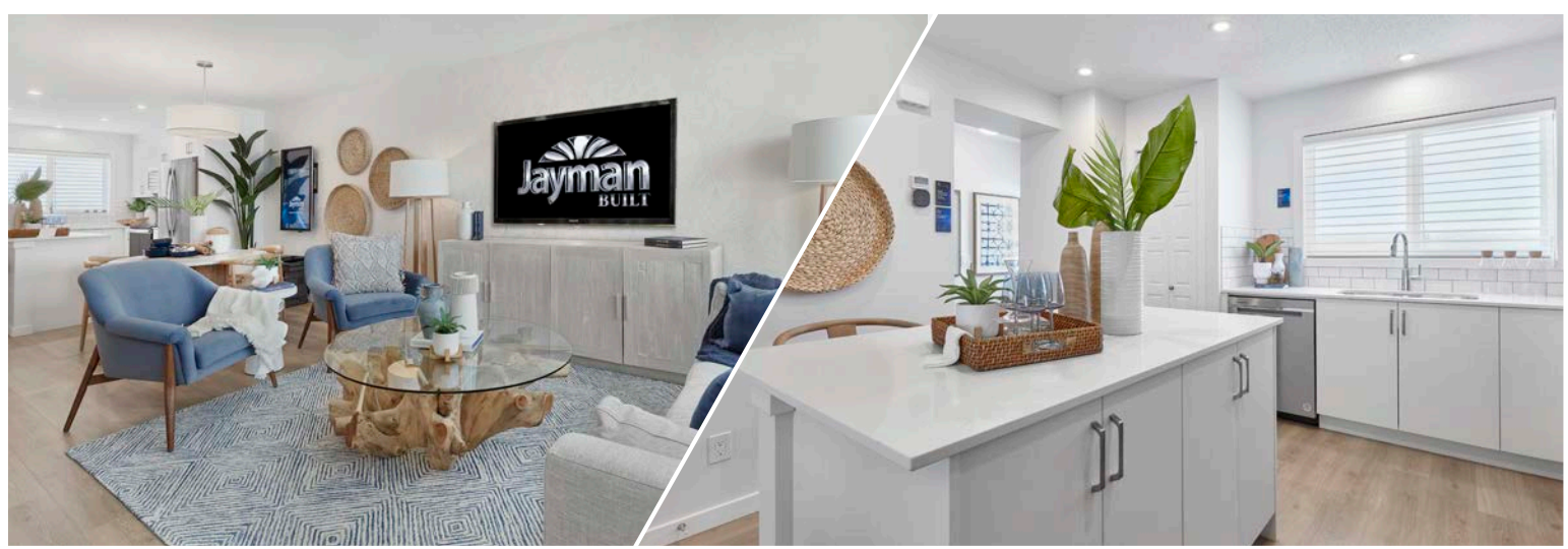
Renderings and images are representational only.