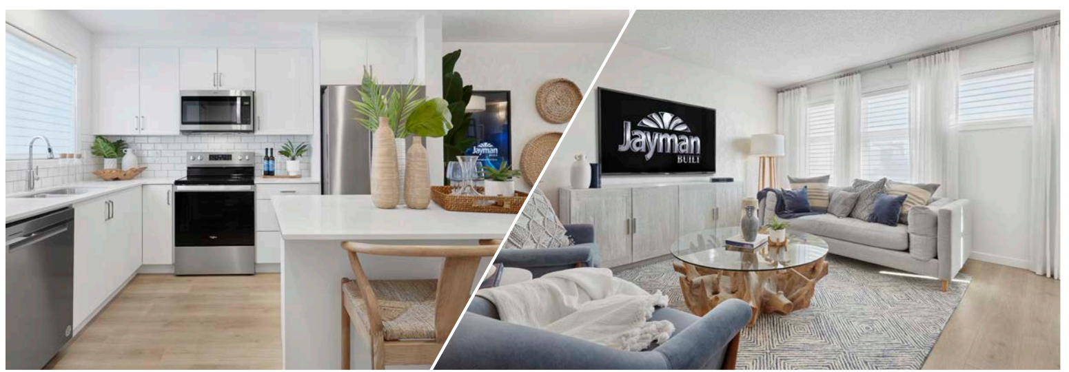
Renderings and images are representational only.