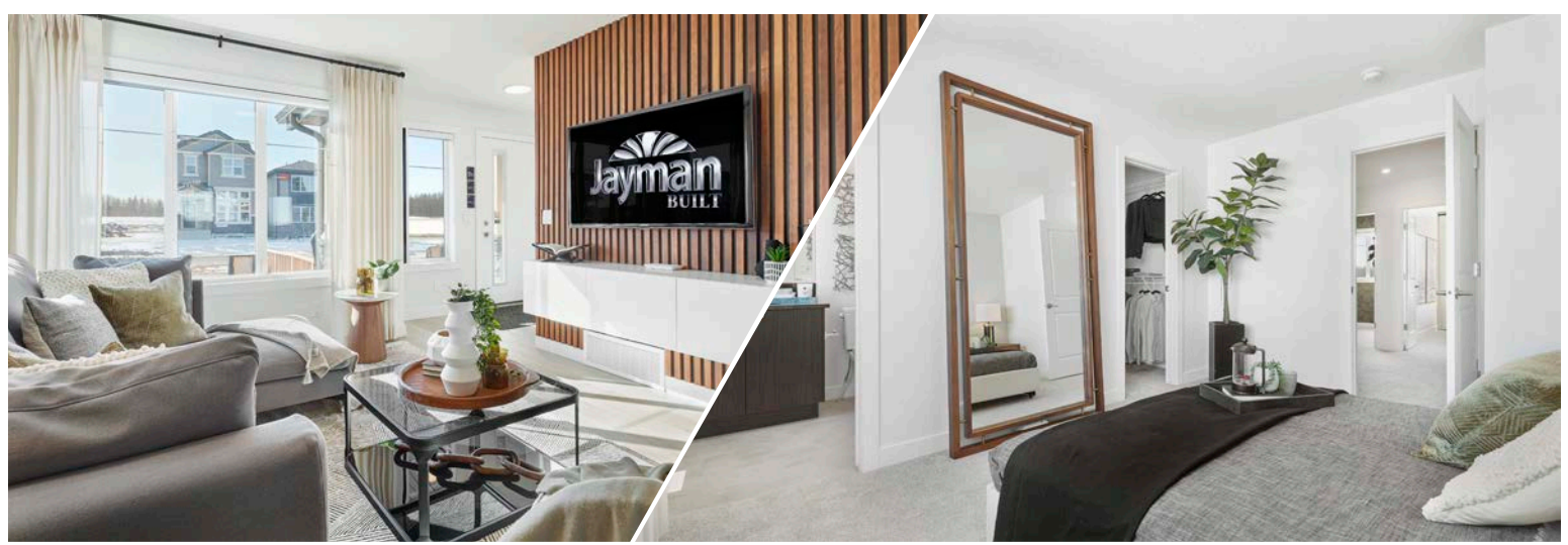
Renderings and images are representational only.