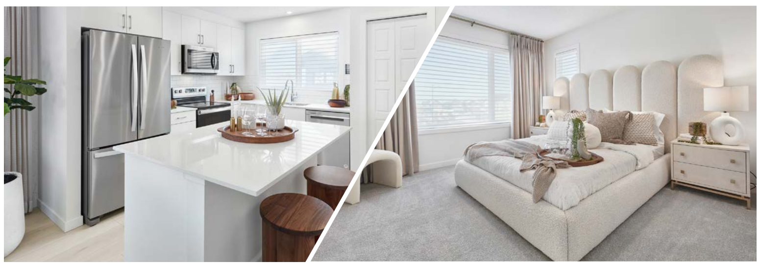
Renderings and images are representational only.