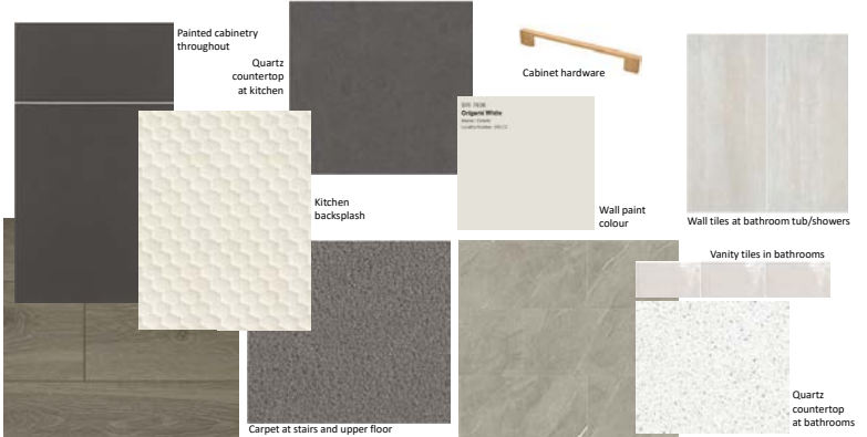
Laminate flooring at main floor

Luxury vinyl tile at upper bathroom & laundr